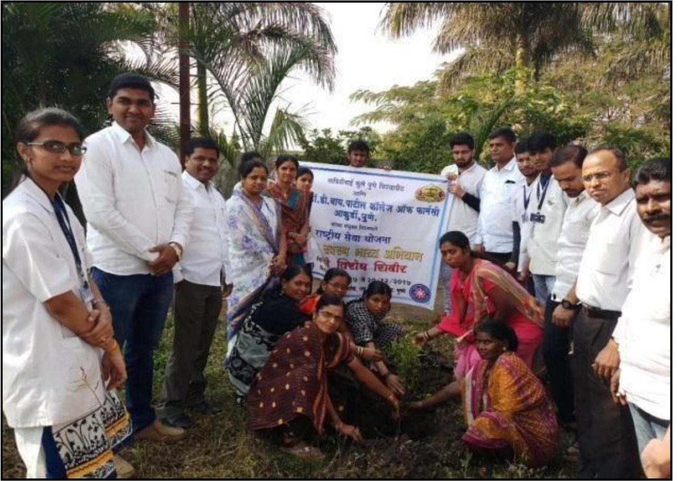
Tree Plantation by Gram Panchayat Members at Chinchwad Gaon.