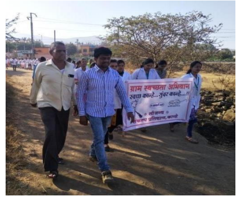
Inauguration and rally conducted on first day of camp for awareness about cleanliness