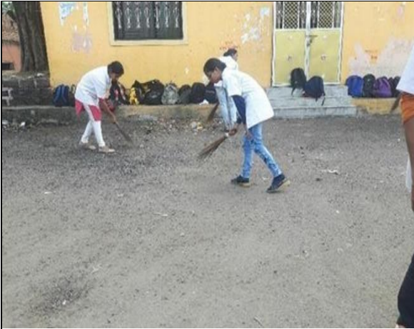
cleanliness drive at Somatane