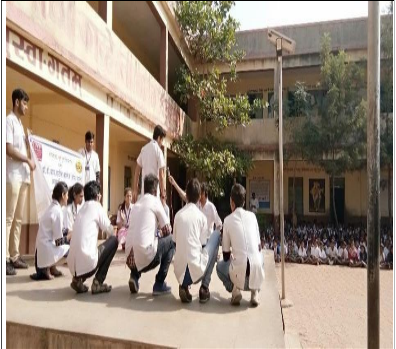
Swachh Bharat Abhiyan cleanliness activity and streetplay about awareness of unhygienic habits.