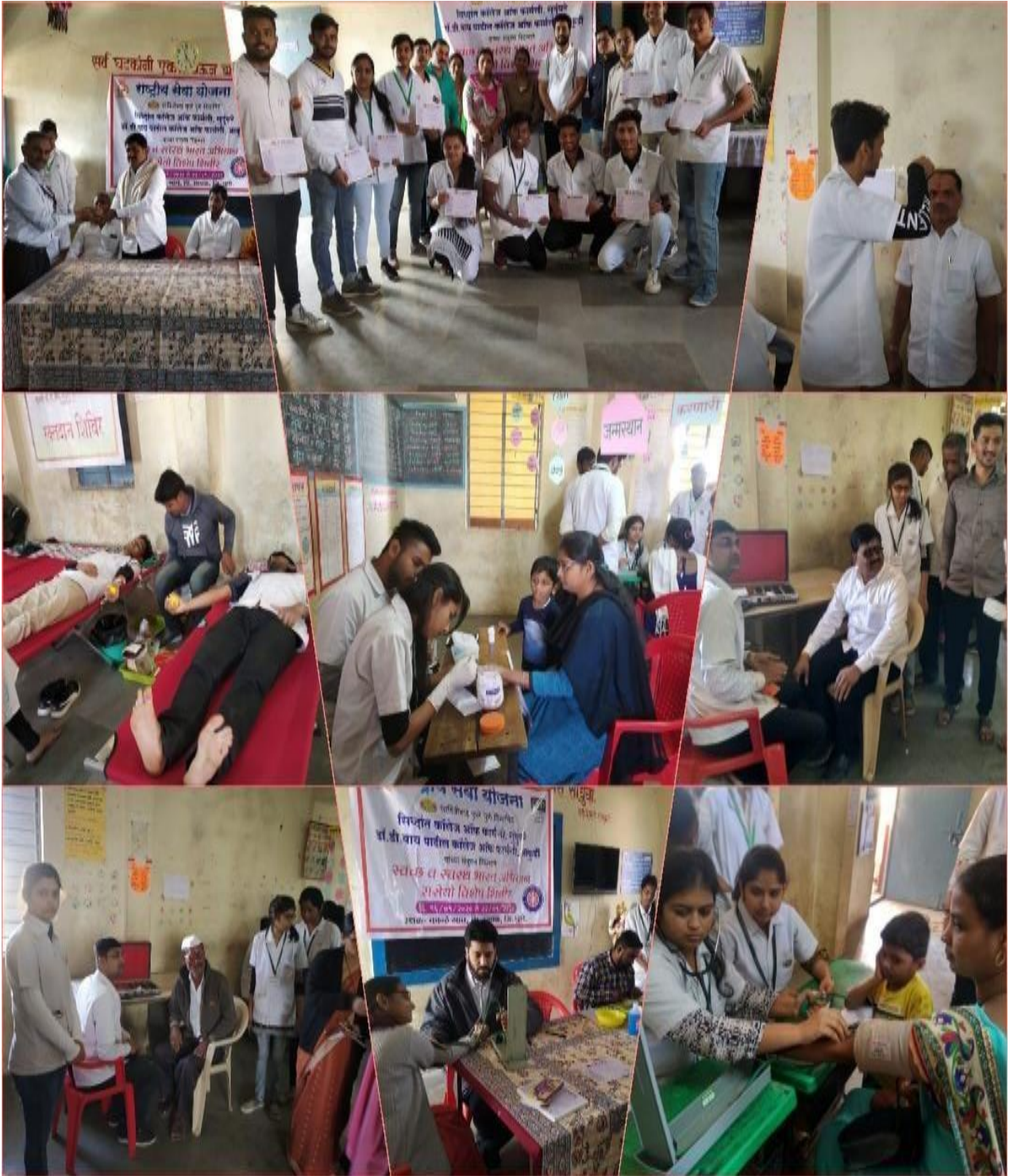
Health Checkup Camp