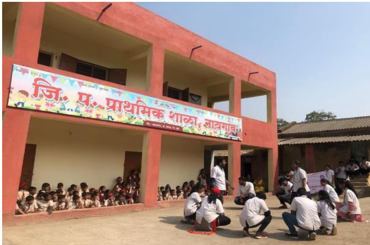
Road Safety Awareness Program