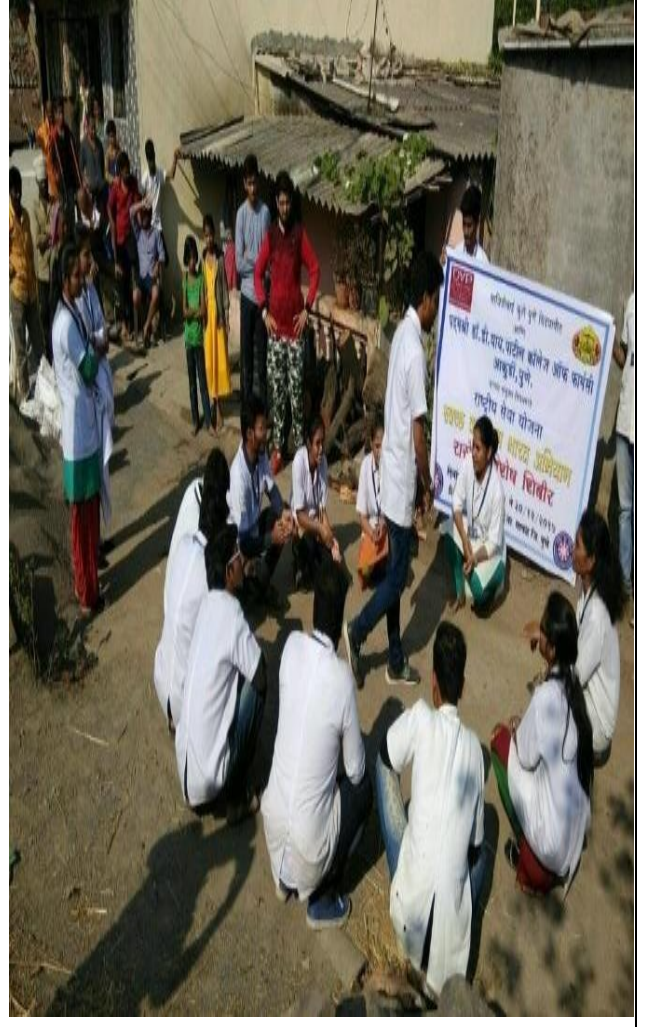
Street play at Naygaon and Kanhe