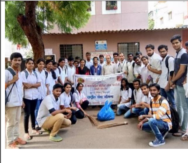
Cleanliness drive at various premises of Akurdi, Pune