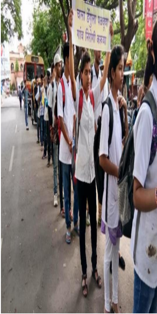
Rally at Akurdi bus stop