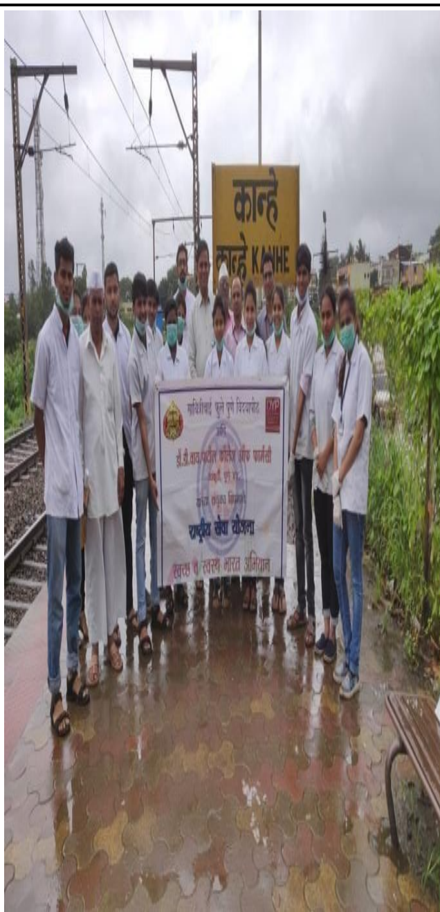
Cleanliness drive activity at Society for The Education of Crippled School