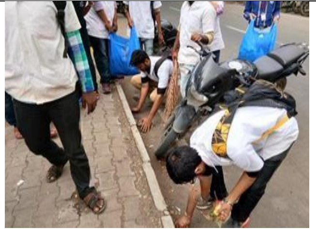
Cleanliness at Akurdi Bus stop