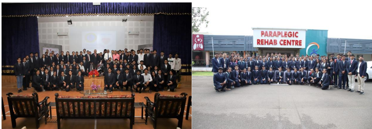
Visit to Paraplegic Rehabilitation Center at Khadki For saluting the contribution of Indian soldiers, college has given them -----