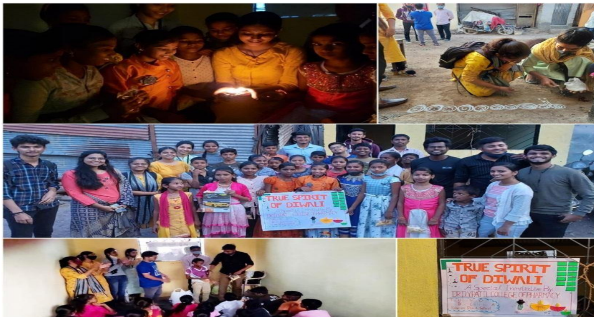
Donation of Essentials to needy people by the students